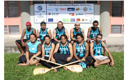
Team PFD ready to rumble in BH2

hopefully "BRING IT" this year. Our goal is to purchase our own paddles and hopefully later a canoe. We also aim to have at least 2 more teams in the BHR next year. The interest of this sport is very much abundant in our organization and is very difficult to select the team. The team fundraised to enter the regatta and also hope to buy paddles with funds raised. The team is thankful to the Kawai Canoe Club that trained them for BH1 and will use this to give ATS a good run in the next Regatta.