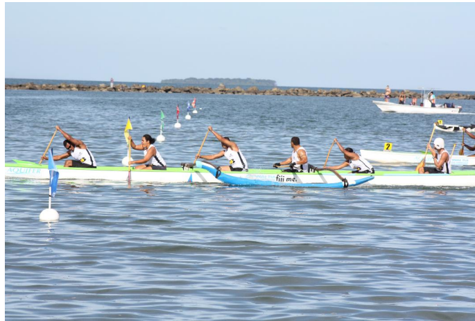
Catch Me if you can: Almost a canoe length ahead of second place getters ATS prove that 3 wins last year was no fluke!

With the points tally from BH1 finalized ATS will still have to work hard to win the overall prize for both regatta. A minimum Top 3 finish will secure it for them anything less and either of the USP, US Embassy and PFD's teams can wrestle the title from ATS.