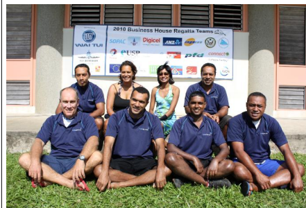
Clay Energy ready to win the battle of the "Energy Companies"

Clay Energy have been trained by the Kawai Canoe Club.