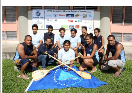
Team SPC Siu'a'alo will flying the SPC flag.

Team SPC Siu'a'alo Team consists of staff from SPC's technical programmes and their family. The word Siu'a'alo is a Tongan word meaning Outrigger Paddling. This is a form of getting together for some of our staff whom we don't usually see during working hours. Further to that it boosts team building, physical exercise, networking and fun. The SPC Siu'a'alo Team is excited at the opportunity to learn more about this exciting sport and to make our mark as well in the competition.