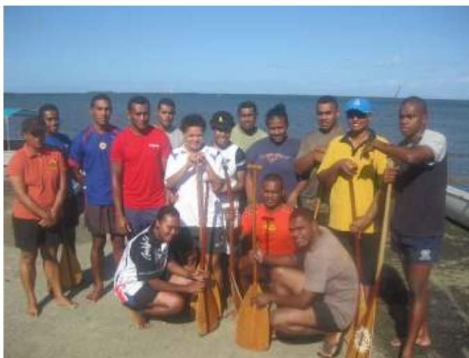
The Fiji Prisons teams after a hard session of training with the Tafaga Club. Prisons will be entering 2 teams in this seasons competition.

Some new entrants will be a force to reckon with over the 2-regatta meet. The Fiji Prisons and Corrections Service represented by their "Wardens" and "Sevens" teams will bring a disciplined approach to the meet.