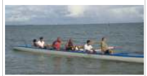
Wardens training hard at the USP Fore-shore.