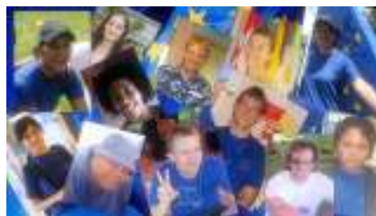
True International Flavour. Will this be the winning combination!

As diverse as we are, we don't have a single real paddler in our midst! As most of our staff are always 'on the road' and many love the sport, we probably couldn't join a club even if we tried!